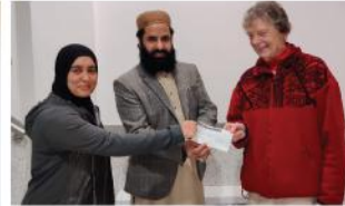
HCM donates £200 to the HRCA

The Madrasa held an assessment and intake session for all those on the waiting list last Thursday and we have registered another 52 students into Madrasa. This means the waiting list has halved.